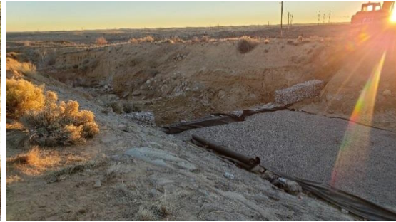
Figure 2. Waste way before grouting.

Canal Repairs - NAPI O&M has completed 4 repairs to canal system in February 2019