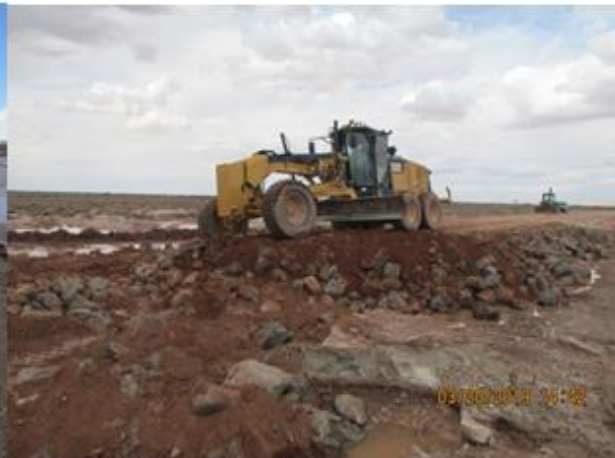
BIA Route N71 – Embankment Repair