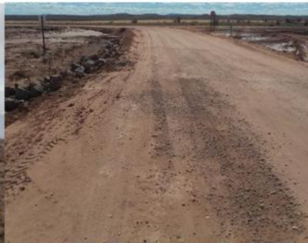
BIA Route N71 – Repair Work Completed