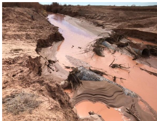
BIA Route N8095 – N. Chinle (Nazlini Wash)

Due to winter storms, the earth roads became extremely muddy and impassable after the snow melted along with the heavy rainfall across the Navajo Nation. The Navajo Nation declared a “State of Emergency” from February 18-28, 2019.