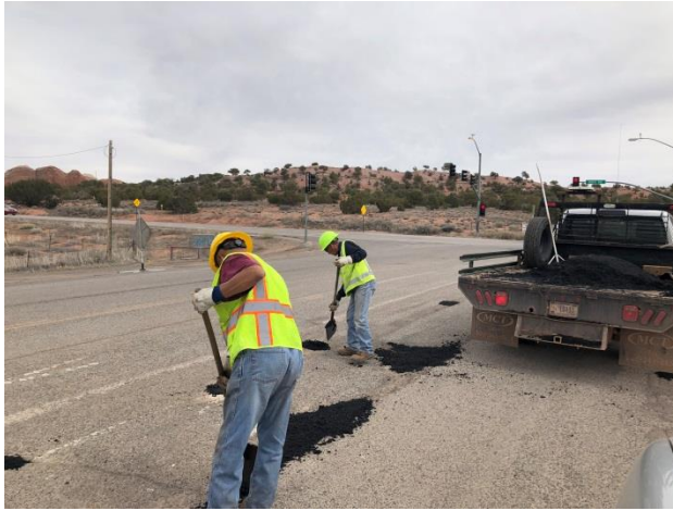
Junction of BIA Route N7/N12

The Agency Road Maintenance Crews continue to perform pothole patching on BIA paved roads that are larger than 4 to 6 inches wide. They are conducting more pothole patching and planning to perform crack sealing work in the next few weeks to prevent any further damage to the structural integrity of roadway. The goal is to crack seal most cracks so the crack sealant material will penetrate the cracks to preserve as much of the paved road surface.