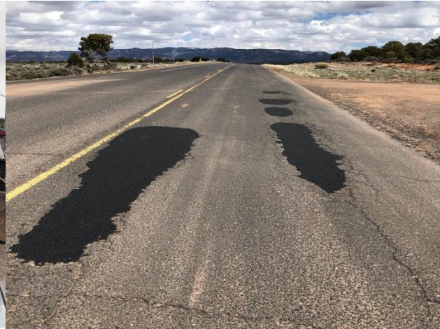
BIA Route N64 – Chinle to Tsaile