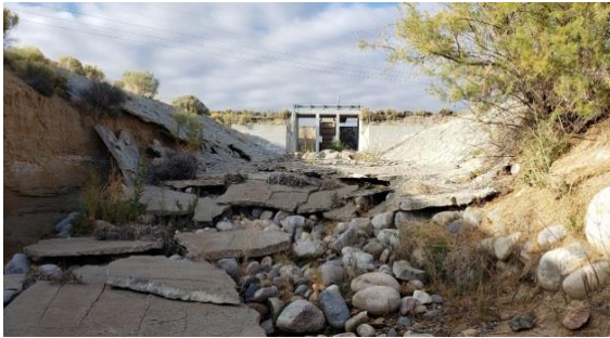
Figure 1. Waste way before repair.

Gravity Main Canal Wasteway Repair – Reclamation completed the last Gravity Main Deficiency by completing the repair work for the eroded channel on February 12, 2019.