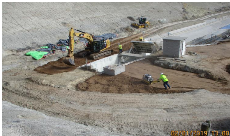
Figure 5. Photo shows backfilling work by Western Gravel Constructors of the repaired Check Structure Inlet and Tunnel #5 Inlet

Deficiency 63 – Tunnel 5 Transition Wall – Reclamation completed the repair of the transition wall during the week of February 11, 2019 ahead of the February 28, 2019 target date.