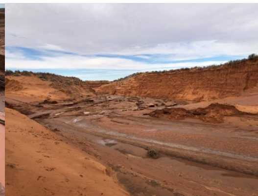
BIA Route N6310 – Tall Mountain (Shonto)