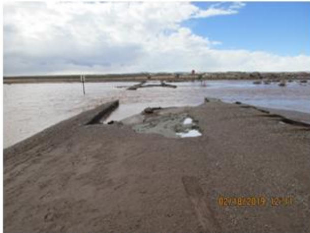
BIA Route N71 – Looking South

In February 2019, the Western Navajo Agency (WNA) experienced heavy rainfall in the Bird Springs Chapter area causing major flooding that severely eroded and washed out BIA Route N71. The WNA Road Maintenance crew closed Junction of BIA Route N71 and N2 for several weeks because the Little Colorado River flooded the area making the roads impassable. The WNA Road Maintenance crew had to wait until the river receded and the soils dried out before repairing the road. On March 22 nd , 2019, the WNA Road Maintenance crew completed the repair work and reopened the roadway to the public. See pictures below: