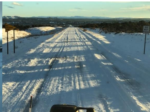
BIA Route N16 – Navajo Mountain

Due to winter storms, the earth roads became extremely muddy and impassable after the snow melted along with the heavy rainfall across the Navajo Nation. The Navajo Nation declared a “State of Emergency” from February 18-28, 2019.