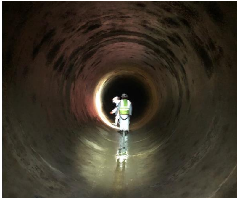
Figure 6. Photo of workers performing a vision inspection of the Gallegos Discharge Line.

February 8, 2019. No anomalies of the Discharge Line were found, however some minor blistering and flaking of the coal tar epoxy lining of the Gallegos Pumping Plant manifold were noted. NAPI subsequently is re-inspected the Gallegos Pumping Plant manifold the week of February 18. NAPI has elected to make repairs of these anomalies in the fall.