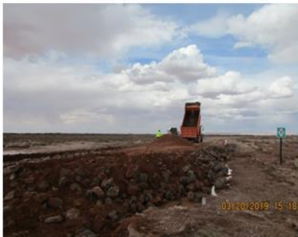
BIA Route N71 – Backfill Material