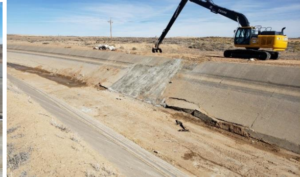
Figures 3. Before Main Canal repair at Sta 1951+00. Figure 4. After photos of Main Canal repair at Sta 1951+00.

Small repairs were also made at Gravity Main Canal Sta 20+20 Left, Gravity Main Canal Sta 33+20 Right, and Gravity Main Canal Sta 32+60 Right.