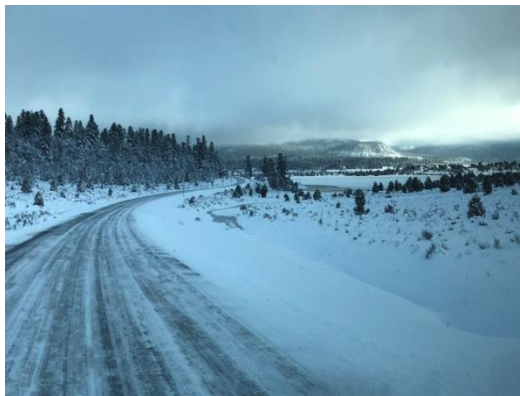
BIA Route 12 – Wheatfield's Lake

This quarter the Agency Road Maintenance crews did an outstanding job assisting and coordinating with the Navajo DOT Road program to keep roads safe during severe inclement weather conditions through.